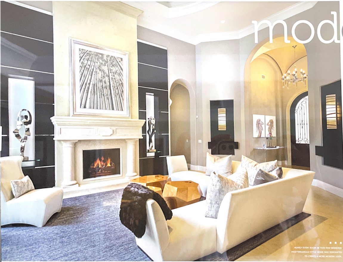
NEARLY EVERY ROOM IN THIS FIVE-BEDROOM MEDITERRANEAN-STYLE HOME WAS RENOVATED TO CREATE A MORE MODERN LOOK.

One of the first challenges the team met was figuring out how to add more living space to the