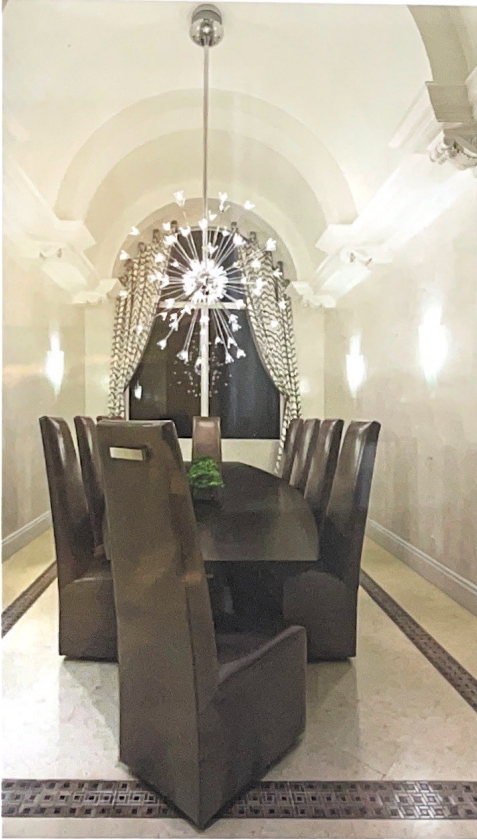
THE DINING ROOM'S BARREL CEILING WAS PAINTED WHITE TO LIGHTEN UP THE ROOM; UNIQUE LIGHT FIXTURES ADD CONTEMPORARY FLAIR; VENETIAN PLASTER REPLACED MIRRORS AND PANELS ON THE WALLS.