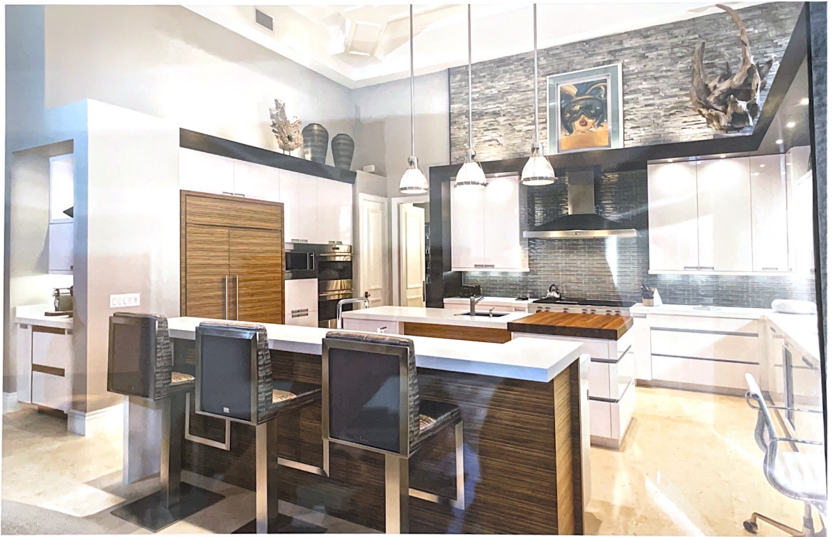
STAINLESS STEEL DETAILS AND APPLIANCES MIXED WITH NATURAL TONES

the living room. "The bar is the first thing you see when you step into the home," explains Morrow. Its curved shape and sunken floor, however, weren't in line with the couple's taste. So the Danmark team filled in the step-down and replaced the bar with a sleek, carved, espresso-stained maple design by Artistry Woodcraft. "We did a specialized cut-out design with our CNC machine, which is used for intricate carvings," says Artistry Woodcraft's Christine Tedesco. "It is definitely interior design eye candy—the intricacy sets that bar apart." Adjacent to the bar, and also in need of a refresh, was a tall, heavy, and ornate fireplace. "We removed some cast-stone details and simplified the mantel," says Morrow. After a few more spot-fixes that included shrinking down and backlighting a few too-tall drywall display niches in the foyer and dining room, Danmark moved on to the dining room ceiling. The room's barrel ceiling and "very heavy" beams didn't exactly play into the couple's modern aesthetic, but instead of removing the beams and possibly creating collateral damage, the team used paint to lighten them up. The white de-emphasizes the impact of looking up into the ceiling spaces, so it becomes